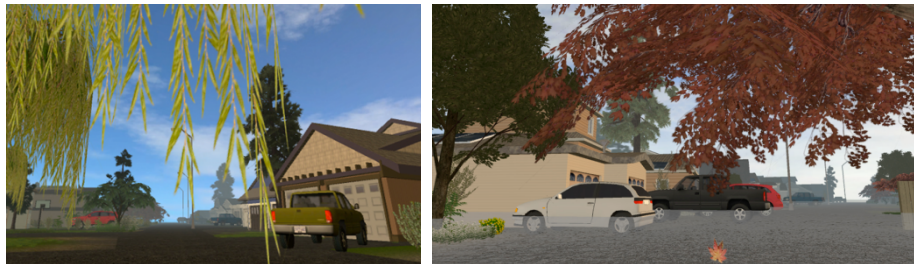
Figure 2. Present Day Beach Grove Road, Delta (left) and Flooding risk in Delta (right).

With the central goal of creating a sustainable environment resistant to climate change in mind, the player can explore the environment in search of information. Specific objects within the environment glow if they have research information for the player to view. The player approaches the object and clicks on it with the mouse. A full-screen panel appears with the information, which consists of an upgrade that the player can implement. When the improvement is built, there is a visual marker of the user's stamp on the environment. The effects of each improvement are also visualized for the user in information windows and indicator bars. There are additional environmental effects such as storm surges, heat waves and flooding that increase in frequency and intensity and are directly linked to the carbon footprint. The player can interact with non-player characters that wander about the neighborhood and enquire about their opinions concerning the changes the player has made to the community. If